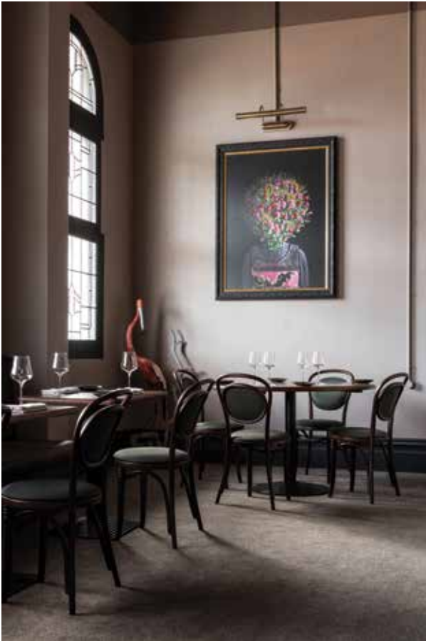
The Royal Hotel