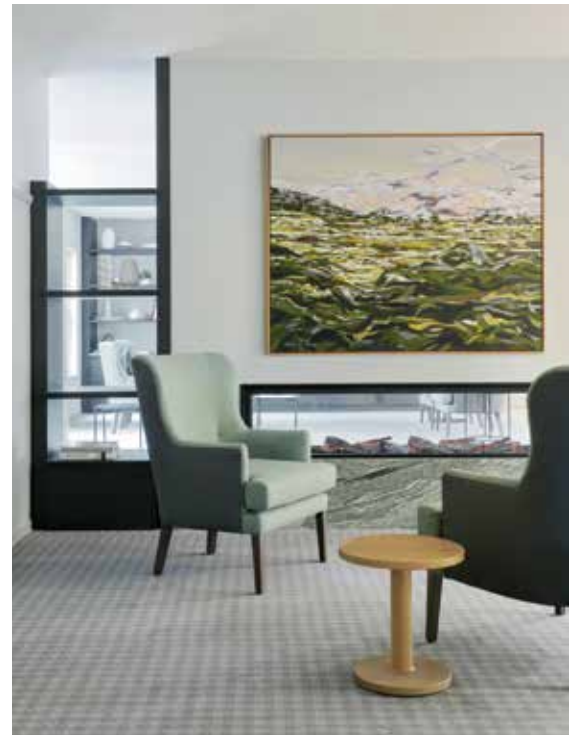
Eva Tilley Memorial Home

The schedule should provide for recording of actual work, done and by whom it is performed, and shall be maintained for reference should any cleaning problems arise. The schedule should be amended as necessary when there is a significant change in the pattern of use of any area.